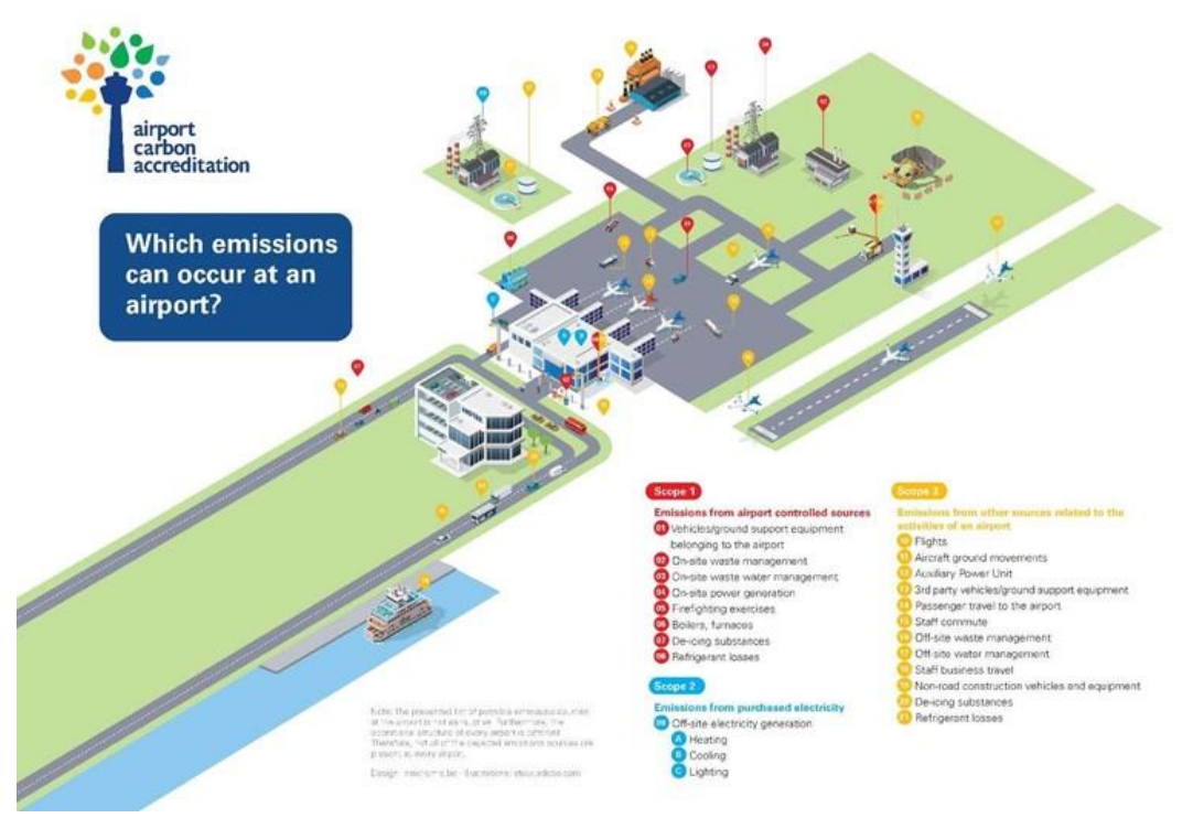
Figure 2: Emission sources at an airport